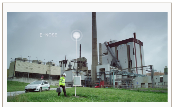
Figure 4: An e-nose in the vicinity of the source of odor.

Due to the subjective nature of odor issues, the OMNISCIENTIS project adopted a holistic approach, combining new technologies from various disciplines with citizen participation. The collaboration of different stakeholders initiated during the project paved the way for improved environmental governance, limited conflicts and a fertile ground for a peaceful cohabitation.