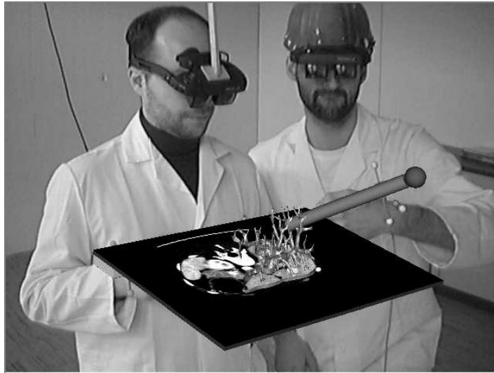
Fig. 2. Collaborative visual evaluation. Both users wear head-tracked HMDs and use tracked input devices.

The hardware setup used consists of different components: stereoscopic see-through HMD(s), tracking system, tracked input devices as well as rendering and tracking workstations. The used optical six degrees of freedom (6 DOF) tracking system delivers position and orientation information not only for the HMD but also for different input devices like pen and interaction panel (PIP). Our input devices have been proposed for the Studierstube , an augmented reality environment library [8]. The pen is furthermore equipped with buttons, to trigger input events.