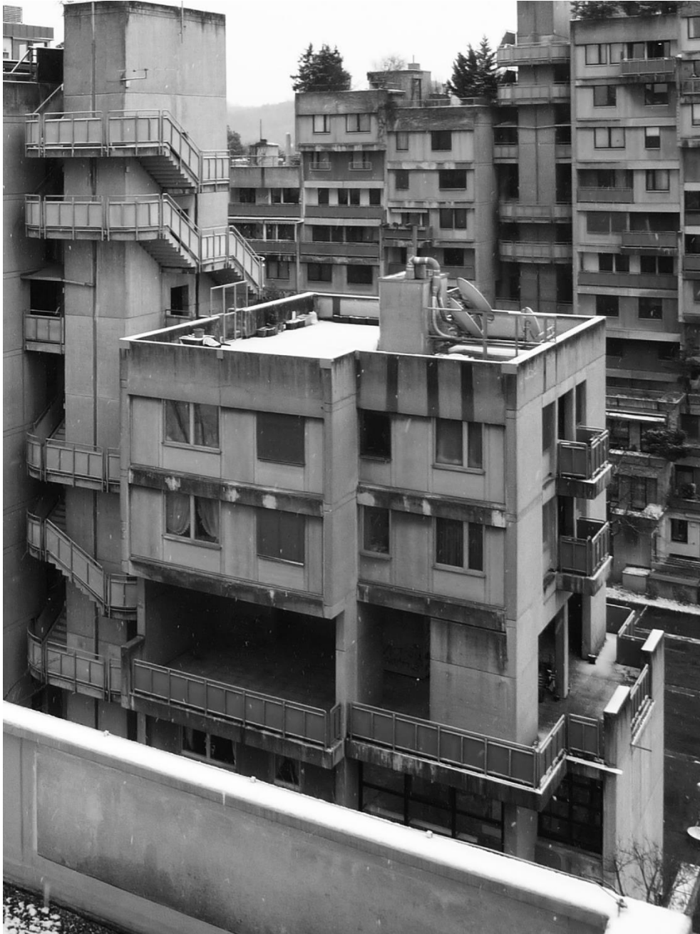
Fig. 4 Building elements affected by the internal insulation strategy: No external surfaces will be visibly affected © Alexander Eberl, 2017.