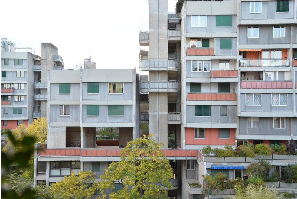
Fig. 1 Werkgruppe Graz, Terrassenhaussiedlung, Graz, Austria, 1972-1978, South-East façade of house No. 33