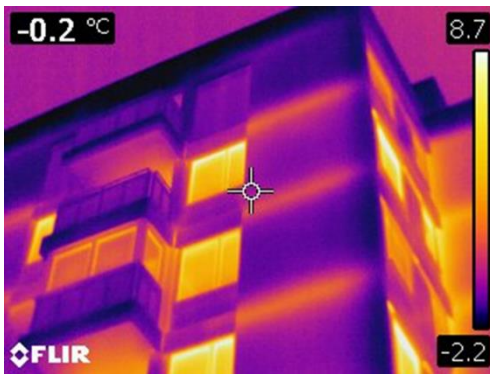
Fig. 2 Thermography of Terrassenhaussiedlung Graz, house no. 33, © Alexander Eberl 2017.