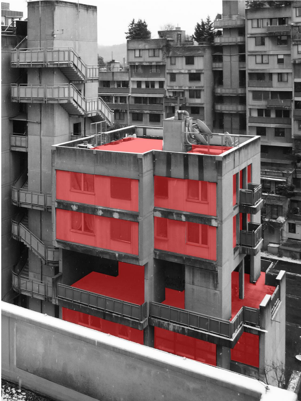
Fig. 5 Building elements affected by Strategy 3: Windows, lightweight walls and roofs will be affected © Alexander Eberl, 2017.