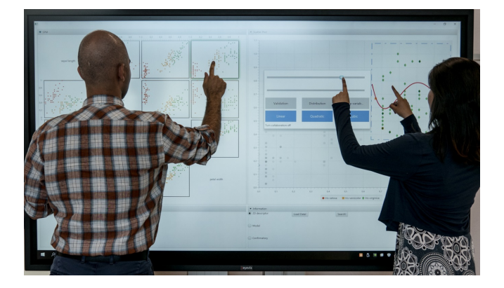
Figure 3: An example of solving visual analytics tasks on a large vertically-mounted multi-touch display.