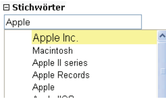
Figure 2: Auto completed semantic tagging.

The trade-off made here is, that currently only one preliminary interlinked meaning per each found tag for all creators is assigned if the interlinking is done ex post where the user has no immediate possibility to interact and help refining the meaning. Although this is not the basic intention of MOAT vocabulary (that allows multiple meanings assignment for single tag) this approach provides a base for the semantic enrichment of social e-Learning platforms.