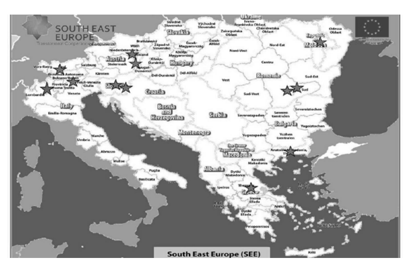
Figure 2: Southeast Europe Programme region with countries of the study area

The SEE Hydropower region includes 6 countries, Austria, Greece, Italy, Moldova, Romania and Slovenia. In figure 2 the area of the Southeast Europe Programme is shown. The domiciles of the 12 SEE Hydropower project partners are indicated by stars.