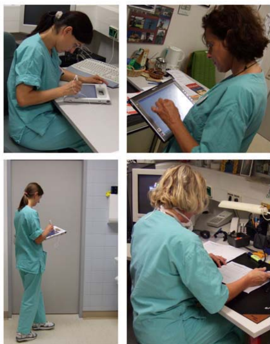
Figure 3. Subjects carrying out experiments

Question 1 had to be rated from 1 to 5 (equivalent to A to E), according to the Austrian grading system, with 1 being the best. Questions 2, 3 and 5 had to be answered with yes or no. In question 4, users selected mouse, stylus or finger. Question 5 allowed free text.