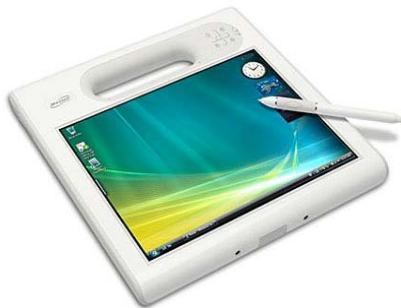
Figure 1. Motion C5 tablet PC

The first one was a Motion C5 (see Fig. 1), which is a stylus operated (only) tablet PC specially designed for applications in professional healthcare environments such as hospitals. The C5 has a 10.4" LCD screen (211x158 mm), a 1.2 GHz Intel Centrino processor, 512 MB of system memory and a weight of 1.5 kg. For our experiments we used the first C5 available in Europe.