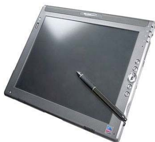
Figure 2. Motion LE1600 tablet PC

The second device was a Motion LE1600 (see Fig. 2), which can be operated with a stylus or finger. In our experiments it was used for finger touch tests only. The LE1600 has a 12.1" screen (246x184 mm), a 1 GHz Intel Centrino processor, 512 MB of system memory and a weight of 1.4 kg. A possible confounding variable is obviously that both devices are not exactly the same size and weight, however, this was not perceived negatively by the test subjects.