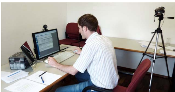
Figure 4: A test person is using the application within the usability lab.

For further evaluation of the task completion, the time the test participants needed to finish each task was logged. For rating each specified scenario the so-called "Time-to-Task" had to be analyzed. Figure 4 shows the test environment of the usability study.