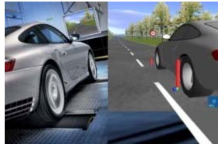
Figure 2: Maneuver and event based testing via AVL InMotion.

The target system is represented by the software component AVL InMotion that supports hardware-in-the-loop (HIL) tests of hybrid vehicles at early stages of the development process. The application simulates virtual routes and maneuver based testing at the test bed, as shown in Figure 2.