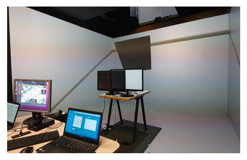
Figure 4. An abstracted environment, e.g., consisting only of the horizon and a box, can be used to test the basic functionality of the collision avoidance algorithm.

There is a clear case for the increased use of VR testing based on experience gained in VR-based product testing. In virtual realities, a wide variety of scenarios can be reproducibly run through—with automatic testing even 24/7. This automatic testing under almost realistic conditions is otherwise not possible. Furthermore, the level of realism can be reduced to a minimum. Such a minimalist scene with only a plane and a box is shown in Figure 4. This reduction enables the efficient debugging and testing of subsystems that would be difficult to test in reality (see Figure 3).