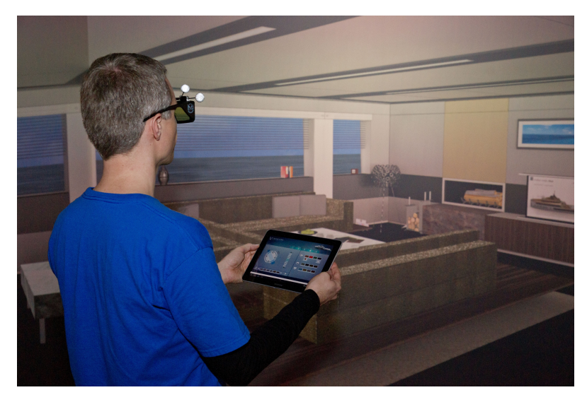
Figure 1. The "usual" test case for a virtual reality environment is a product evaluation, i.e., inspecting and evaluating a product such as a building, a car, a yacht, etc., in order to obtain a realistic impression of the final product.

All of these points, especially the reduced development time and elimination of the hazard potential of developed prototypes, are the foundation of the hypothesis investigated.