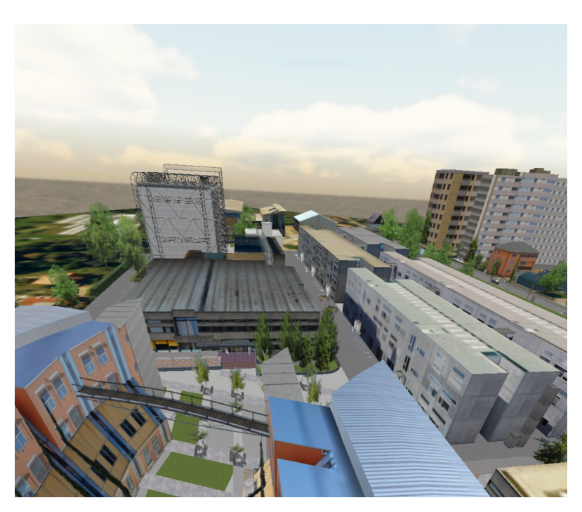
Figure 3. The test area for the drone consists of trees and buildings that serve as potential obstacles. The VR scene guarantees absolute control and thus reproducibility, but it will not contain any elements which have not been designed in advance.

In short, the collision avoidance system of the drone can be tested in its entirety. The processing of the camera images is done in the same way as it is done in the real world. Furthermore, the test setup is an authentic representation of the real world, without the danger of crashing the drone into an obstacle.